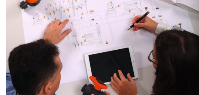
GF Piping Systems offers comprehensive project support with regard to chemical resistance, choice of material, installation and jointing technology.

Compared to widely used PFA solutions, ECTFE is also characterized by optimum permeation and strength properties.