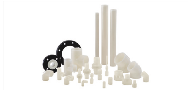
The SYGEF ECTFE product range includes pipes, fittings and the necessary jointing technology.

The SYGEF ECTFE system enables reliable and safe transportation of chemicals with a pH value of 0 to 14. The combination of SYGEF ECTFE components with the latest IR welding technology ensures a tested connection and offers the highest level of safety for people, the environment and the production process. These properties enable the optimum use of ECTFE in segments such as the chemical process industry, water treatment and microelectronics.